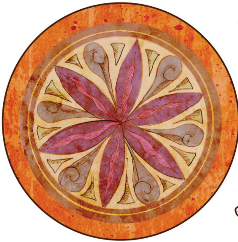
A little table for tea

PUT TABS THROUGH SLITS (A) AND TAPE TO BASE