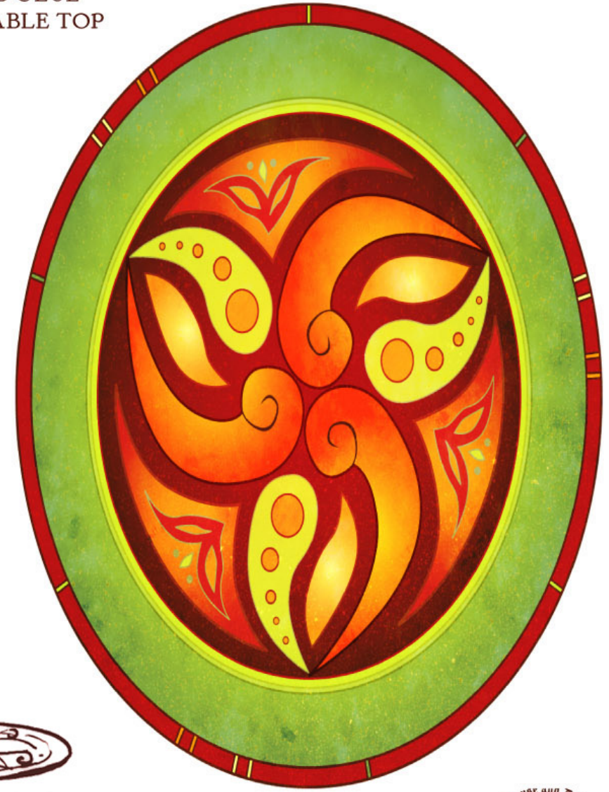
A Fairy Rug