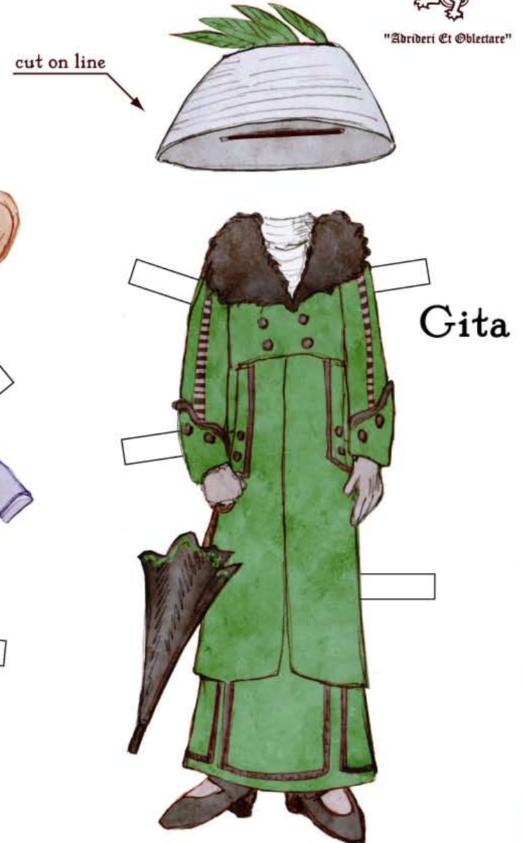
This is an ladies' walking suit from 1910.