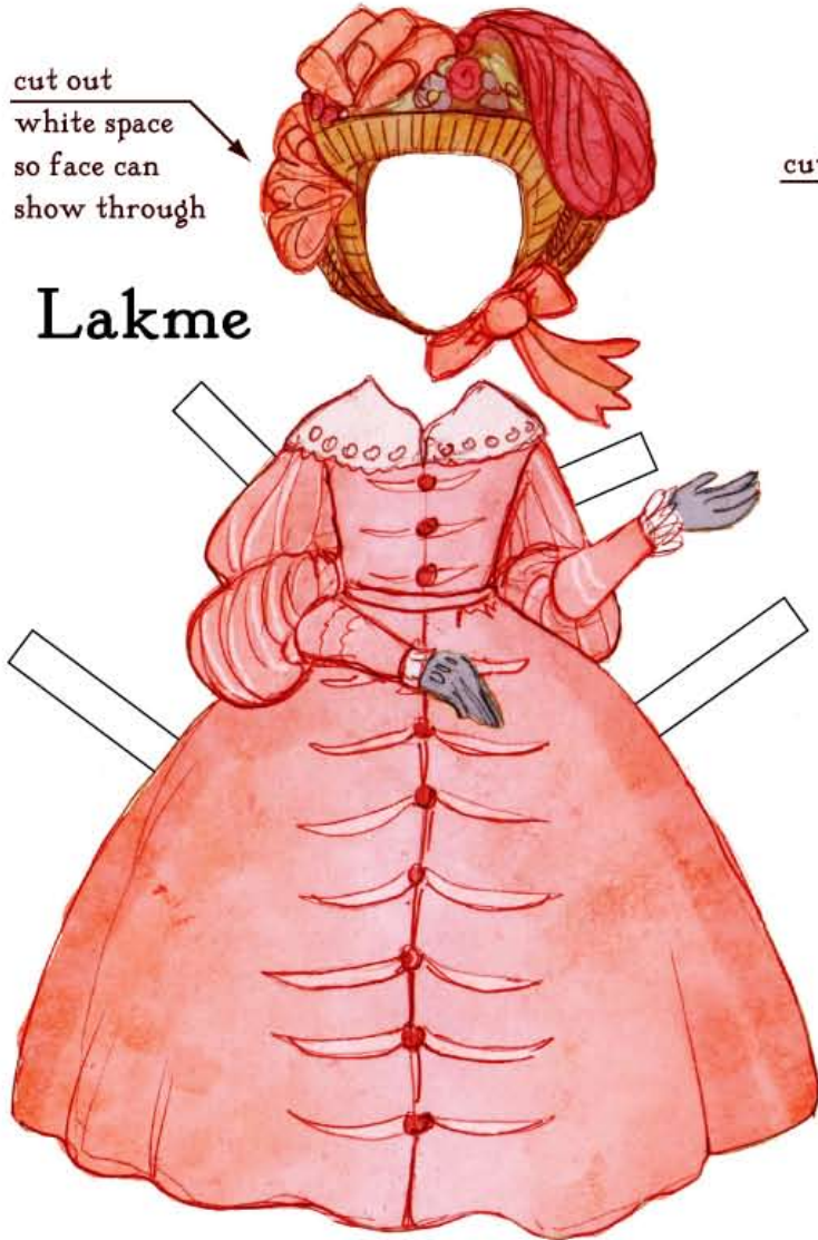
This is an outfit for a fashionable lady from 1835.